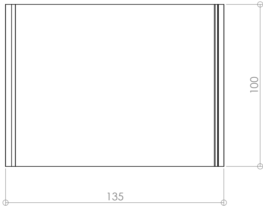
Top View Scale 1:1.4